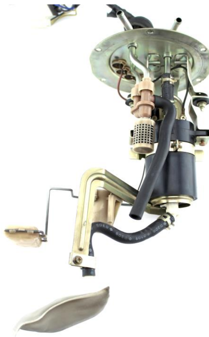
< Z32 Assembly Shown