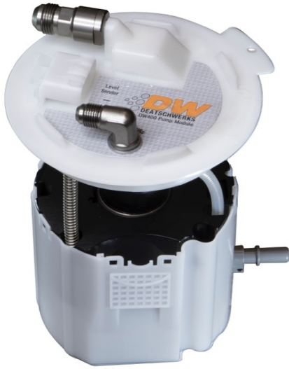
*module shown in return-style configuration

The DW400 5th gen Camaro Module is a complete plug-n-play replacement for the OE unit. The module incorporates the DW400 pump to nearly double the flow output of the OE Camaro SS module and increases pressure capabilities to 120psi. This module also integrates seamlessly with the OE wiring harness, level sender, and feed lines. For those wanting a return-style fuel system, the module is easily convertible to -8AN feed and -6AN return. The module also utilizes a venturi fed surge bucket for consistent fueling at low tank levels and high G conditions.